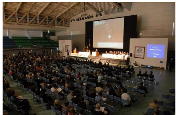
Fig. 6 Opening ceremony of 5th cities on Volcanoes conference in the city hall of Shimabara. Taken 19 November 2007.

This was considered as the world-wide recognition for the Unzen's business which targeted on education to protect natural disasters and to transfer lessons from the disasters to the next generations, and the volcano tourism. That is, by utilizing disaster remains and sediment work facilities, the disaster-prevention education aimed at elevating the human minds on