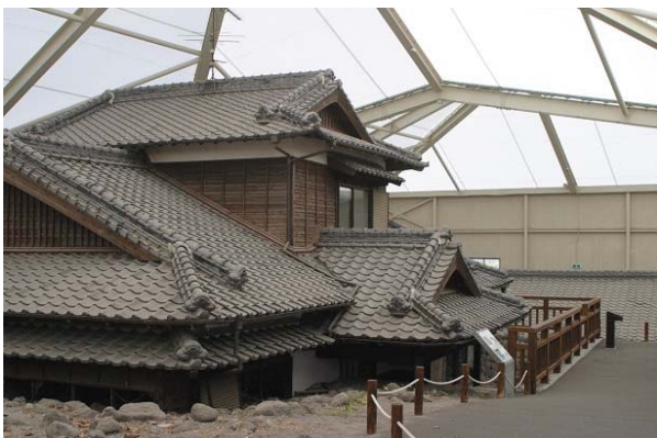
Fig. 4 Park of houses buried by mudflow deposits during the Unzen eruption.

This park was built as one of major businesses in the region revival plan, beside the government-designed rest area along the main road, for contributing to job creation and restoration/development in the disaster-affected area. This park was designed to let to know for visitors how strong destroying power of lahar and the importance of prevention of natural disasters. The entrance fee is free, and annually 450,000 visitors come to this park.