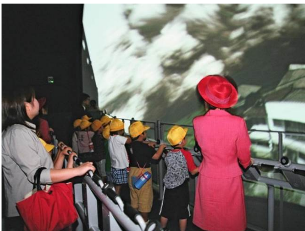
Fig. 3 Inside the dome theater of the Mount Unzen Disaster Memorial Hall.

Eleven houses which were buried with sands and gravels from lahar in the last eruption are preserved in this park. To avoid damage from wind and rain, three houses were located in a large tent.