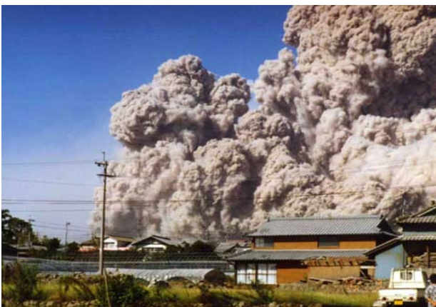
Fig. 2 Ash cloud of pyroclastic flow, which occurred in the Shimabara City on Annaka area, Nagasaki Prefecture 1991.