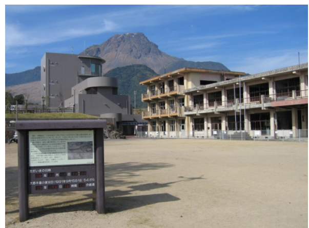
Fig. 5 Ohnokoba Elementary School building burned by pyroclastic flows on 15 September 1991. Back is the Heisei-Shinzan (lava dome formed in the 1991-1995 eruption).

Though it is important to preserve disaster remains as monuments for conveying the disasters to visitors and letting them consider on the disasters, more important are intentions of bereaved families and local